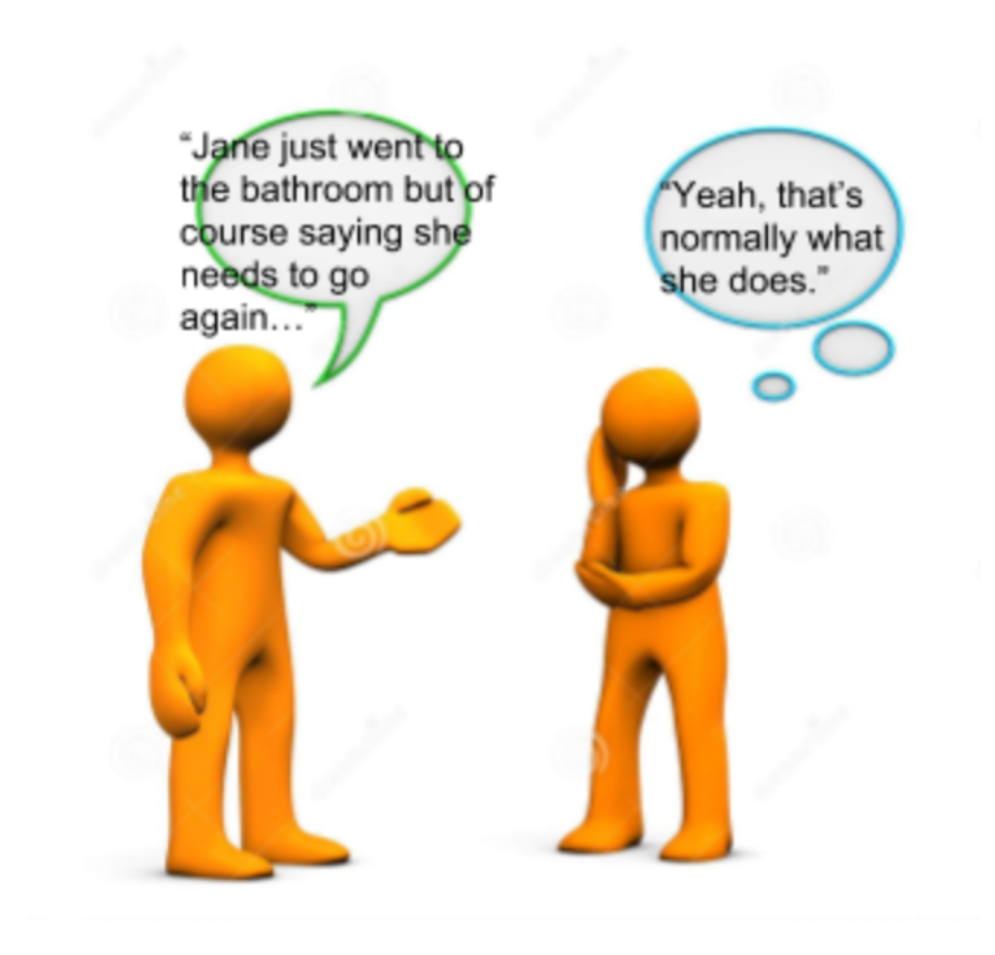
Figure 1. Experiences of nurses caring for individuals with alzheimer's disease. This figure illustrates an observation of two nurses feeling frustrated and agitated when caring for individuals with dementia.